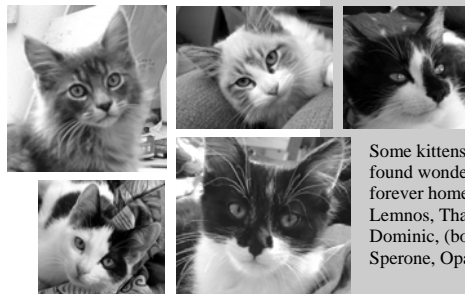
Some kittens that have found wonderful forever homes: (top) Lemnos, Thalia, Dominic, (bottom) Sperone, Opalia

Best Friends Pet Cremation Services PETCO The Enchanted Cat Club ABQ Mini Storage The Mechanic TJ's Camera & One Hour Photo Fast Signs on Menaul SpeedZone Print & Copy Honeywell