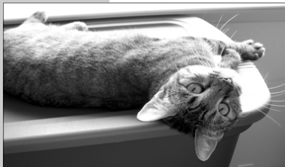
Patty Duke—now Serafina